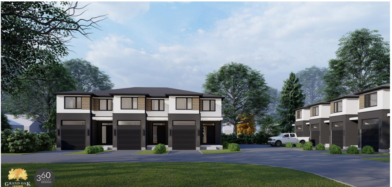
Conceptual Rendering 459 Hale Street, view looking south.

The above images represent the applicant's proposal as submitted and may change.