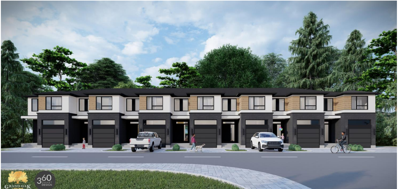
Conceptual Rendering 459 Hale Street, view looking west.