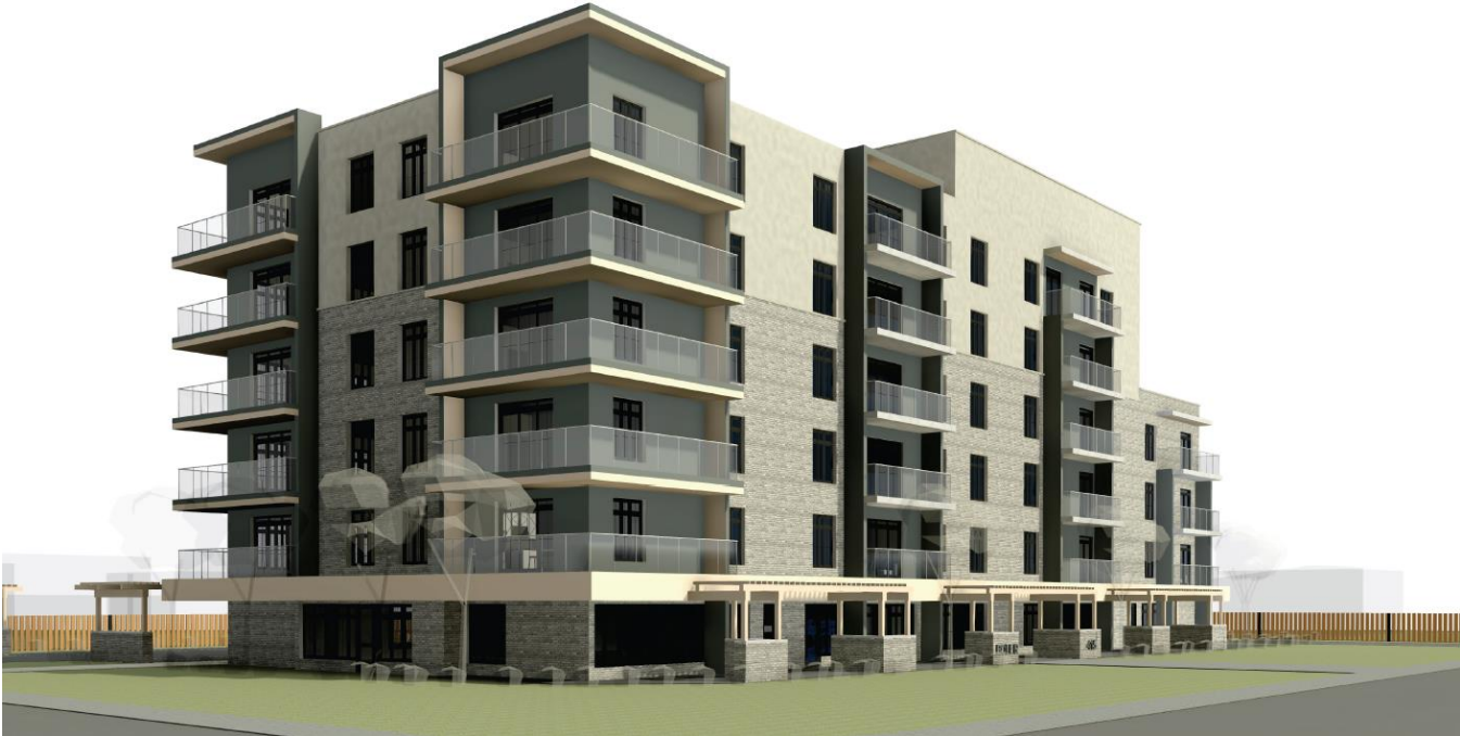
Conceptual Rendering (view from intersection of Byron Baseline Road and Boler Road)

The above image represents the applicant's proposal as submitted and may change.