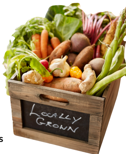
Picture 1.2 Box of locally grown vegetables

The City of London has 21 community gardens located on City property within 14 neighbourhoods. 18 of the gardens are allotment-based plot rentals administered and supported by the City of London, and 3 are neighbourhood-managed, meaning they are managed and operated by residents. Gardens are accessible to residents year-round, however the operational season runs from May 1 – September 30. During this time, there is water access and City staff maintain the common areas in and around the gardens. In 2024, the operational season was extended to October 31 due to unusually mild temperatures.