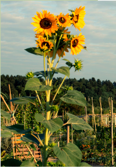
Picture 1.3 Sunflowers