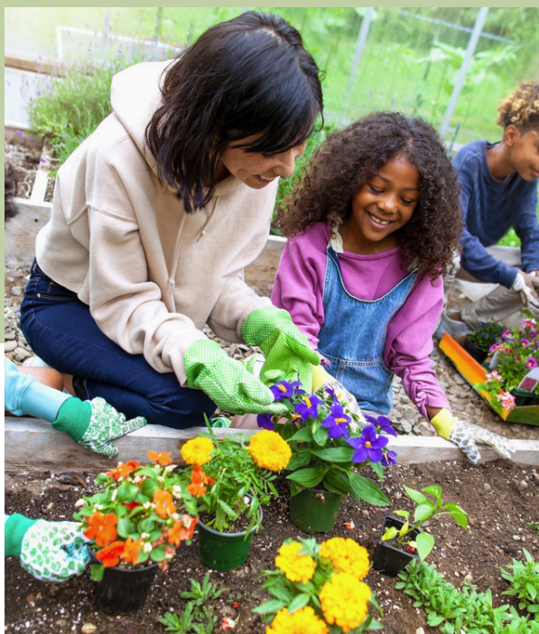
Picture 1.1 Gardeners planting flowers in a raised garden bed

The Community Garden program in London, Ontario features 559 garden plots tended to by more than 600 dedicated gardeners across London. Community gardens play a vital role in increasing food security among Londoners by providing them with the means to grow their own fresh produce. Community gardens also foster a sense of unity and cooperation, where participants share knowledge, resources, and the fruits of their labour.