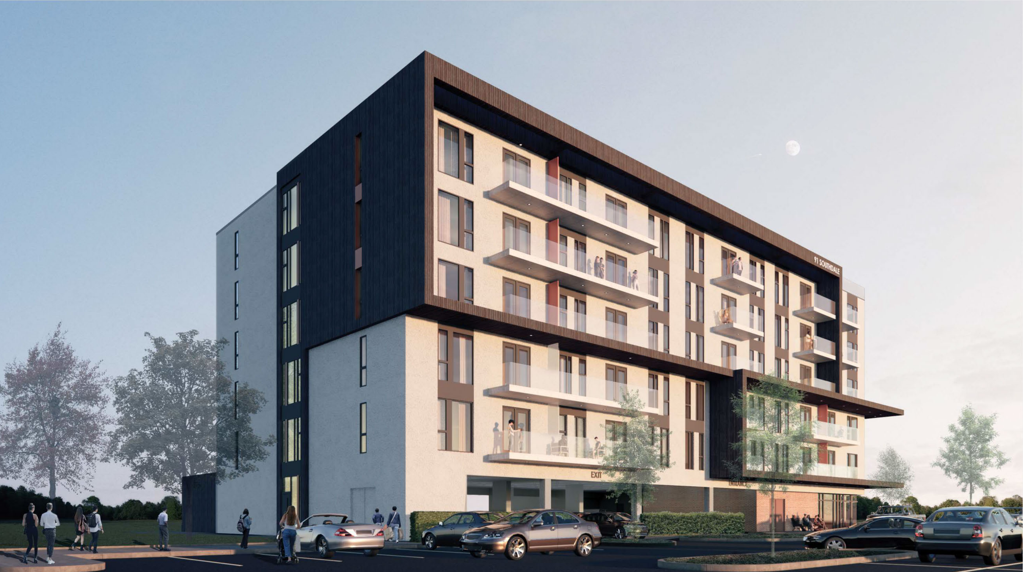
MAIN PARKING LOT VIEW