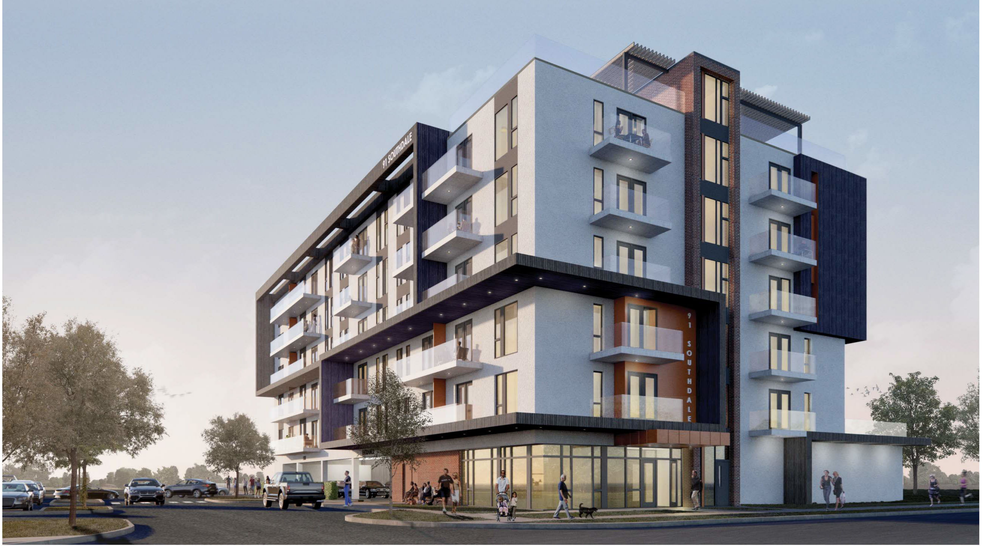
MAIN ENTRANCE CORNER VIEW