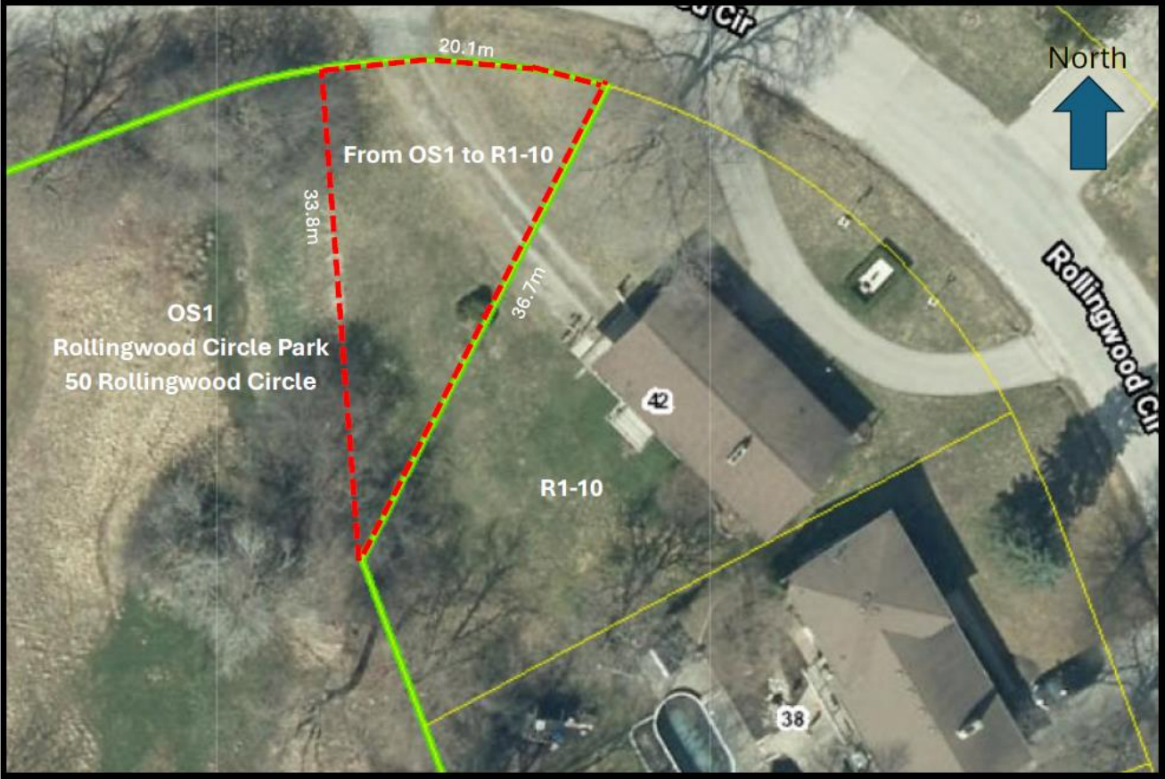
Proposed Concept Plan

The above image represents the applicant's proposal as submitted and may change.