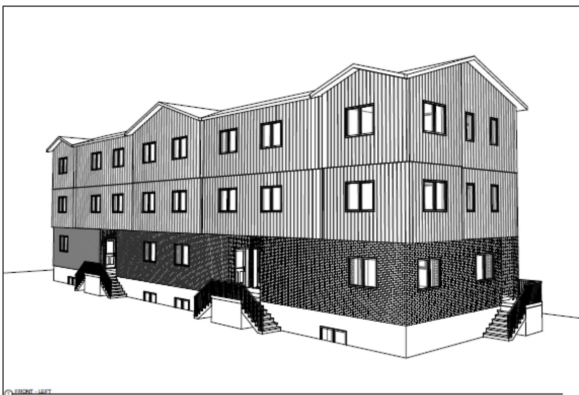
3D view Front-Left Façade

The above images represent the applicant's proposal as submitted and may change.