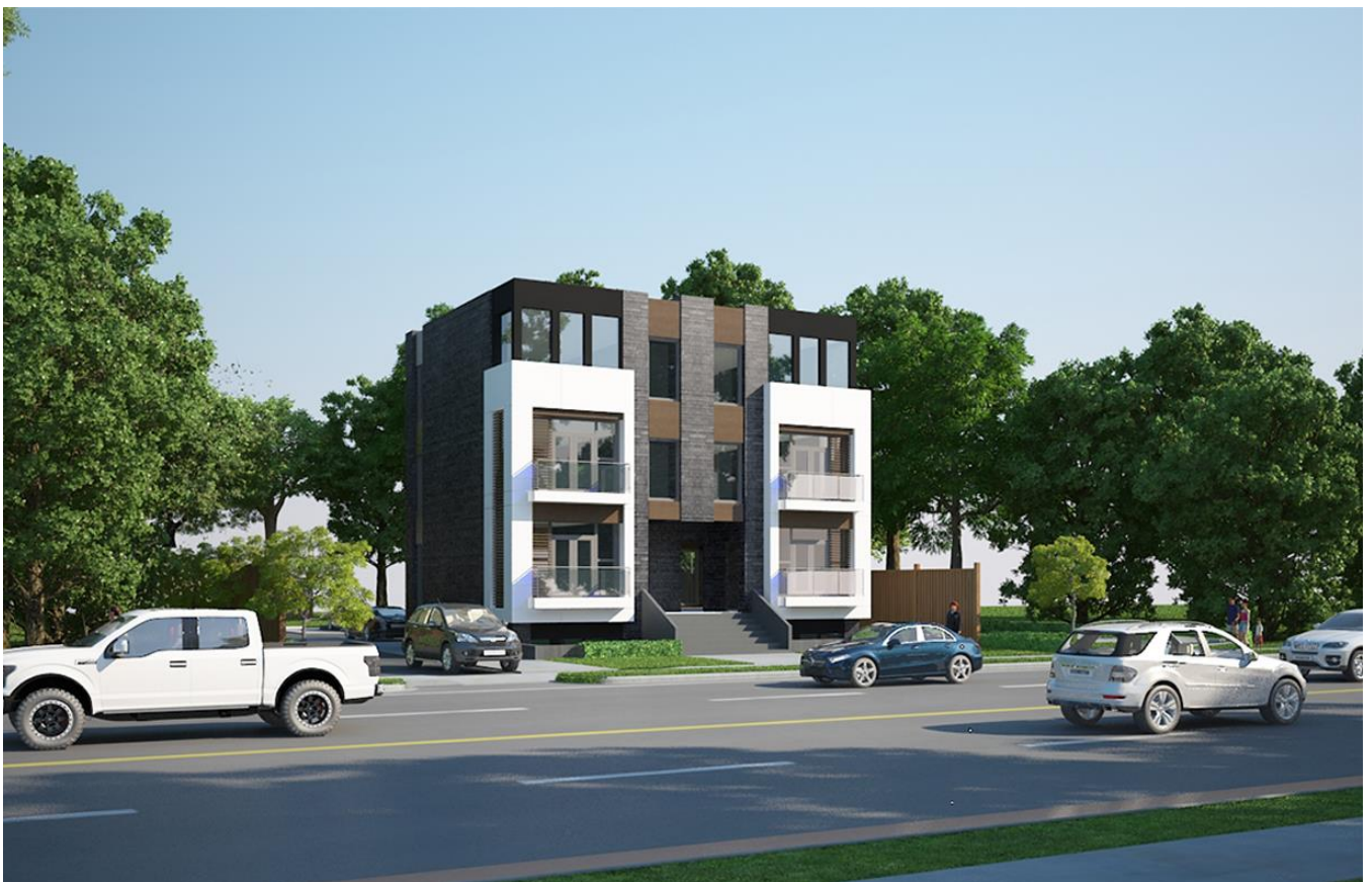
Conceptual Rendering Proposed Development 691 Fanshawe Park Road East.