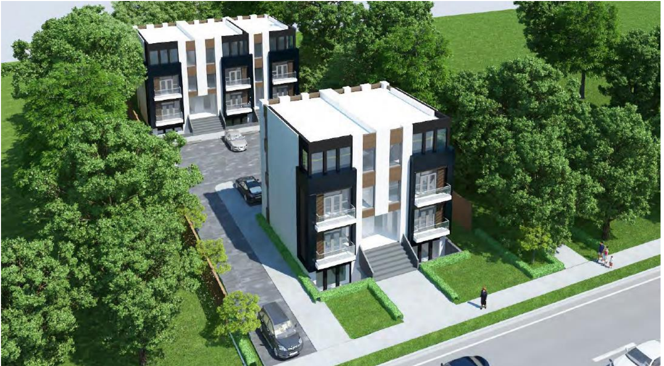
Conceptual Rendering Stacked Townhouse Development 691 Fanshawe Park Road East.

The above images represent the applicant's proposal as submitted and may change.