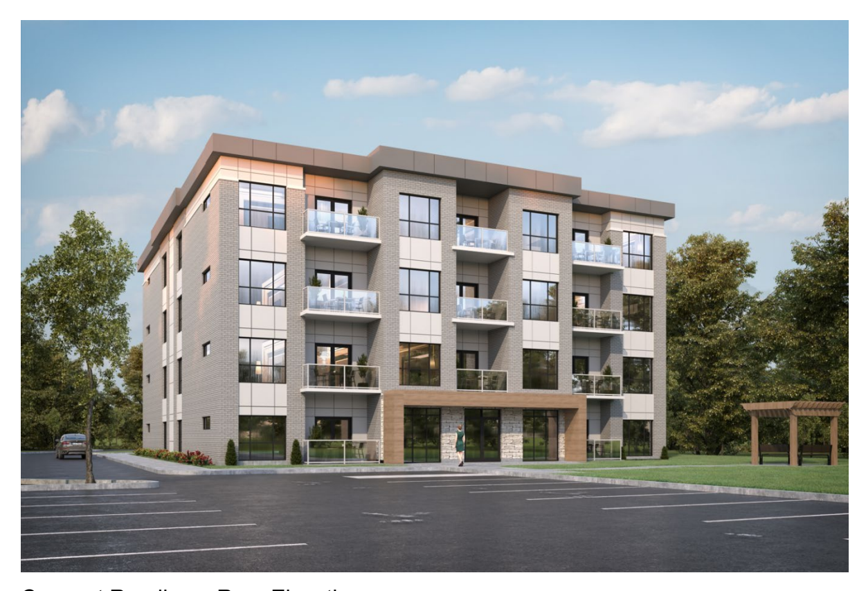
Concept Rending – Rear Elevation

The above images represent the applicant's proposal as submitted and may change.