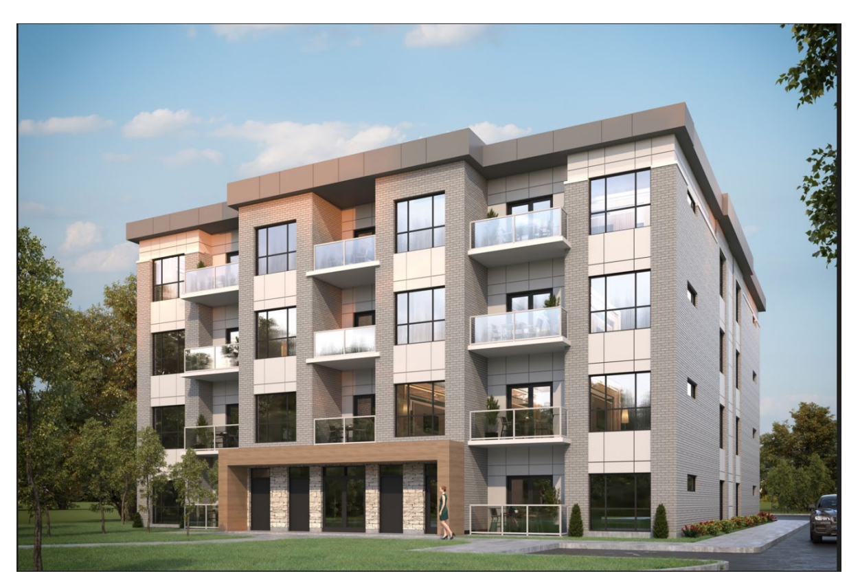
Concept Rending – Front Elevation (Commissioners Road West facing)