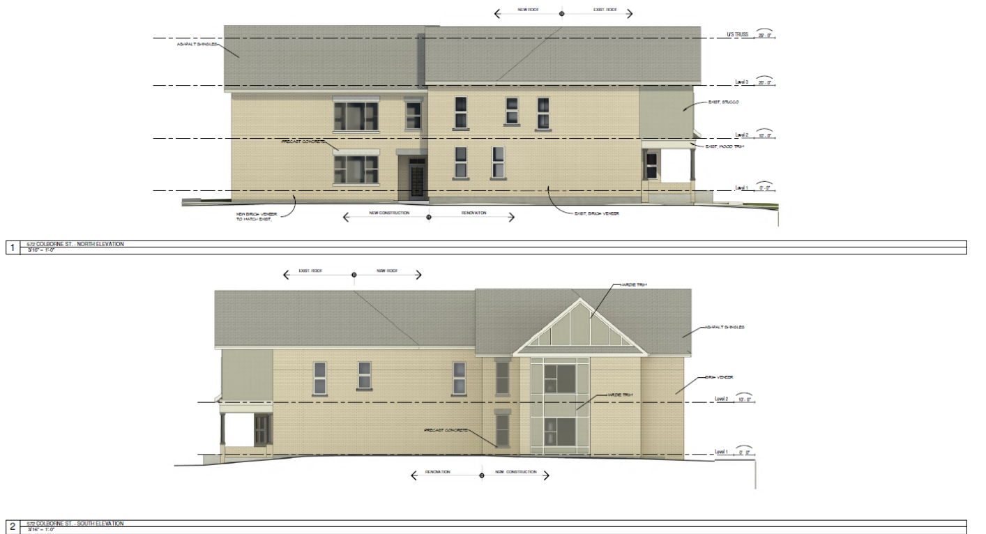
Figure 3: North and South Elevations of 572 Colborne Street.