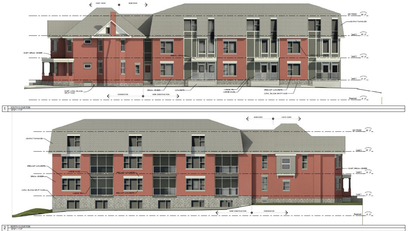
Figure 2: North and South Elevations of 578 Colborne Street