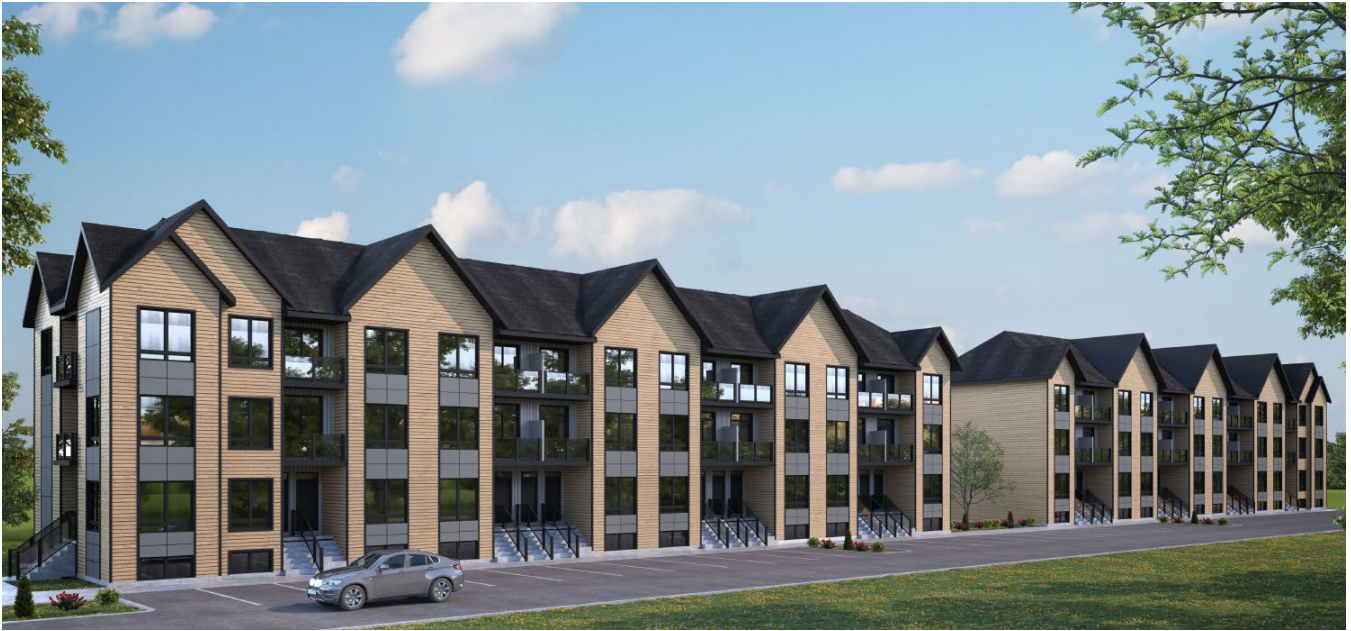
Rendering elevation 1210-1240 Wharnccliffe Road South

The above images represent the applicant's proposal as submitted and may change.