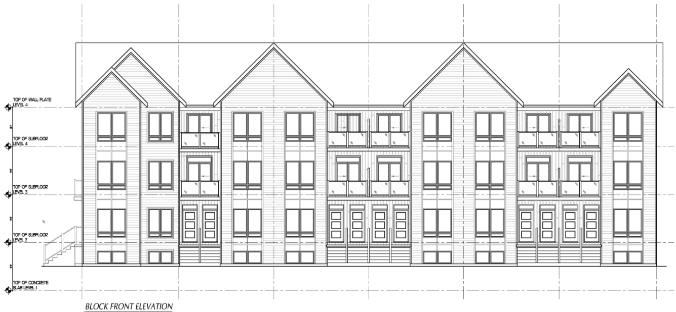
Front Elevation 1210-1240 Wharncliffe Road South