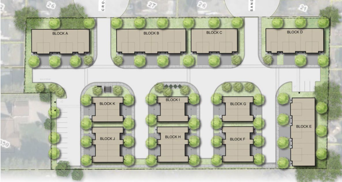
The above image represents the applicant's proposal as submitted and may change.