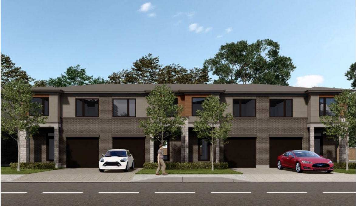
The above images represent the applicant's proposal as submitted and may change.