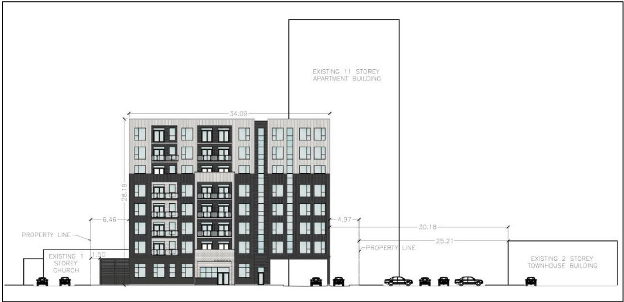
Cross Section 8-storey apartment building, looking north from Base Line Road.