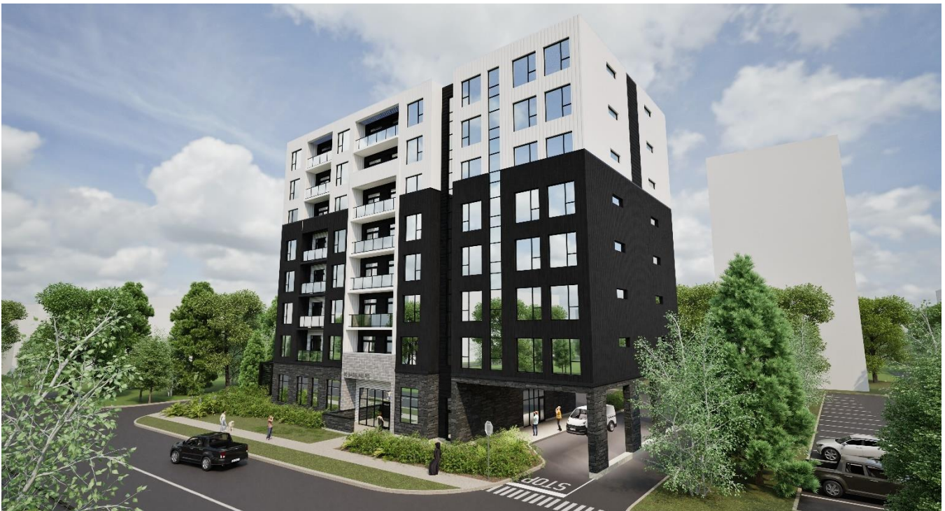
Rendering 8-storey apartment building, looking northwest.

The above images represent the applicant's proposal as submitted and may change.