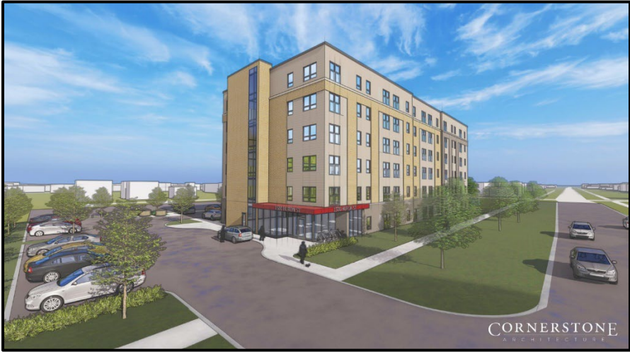
Proposed building rendering.

The above images represent the applicant's proposal as submitted and may change.