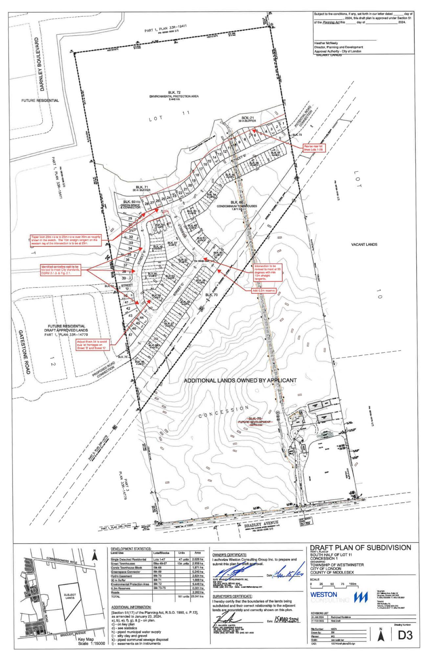
The above image represents the applicant's proposal as submitted and may change.