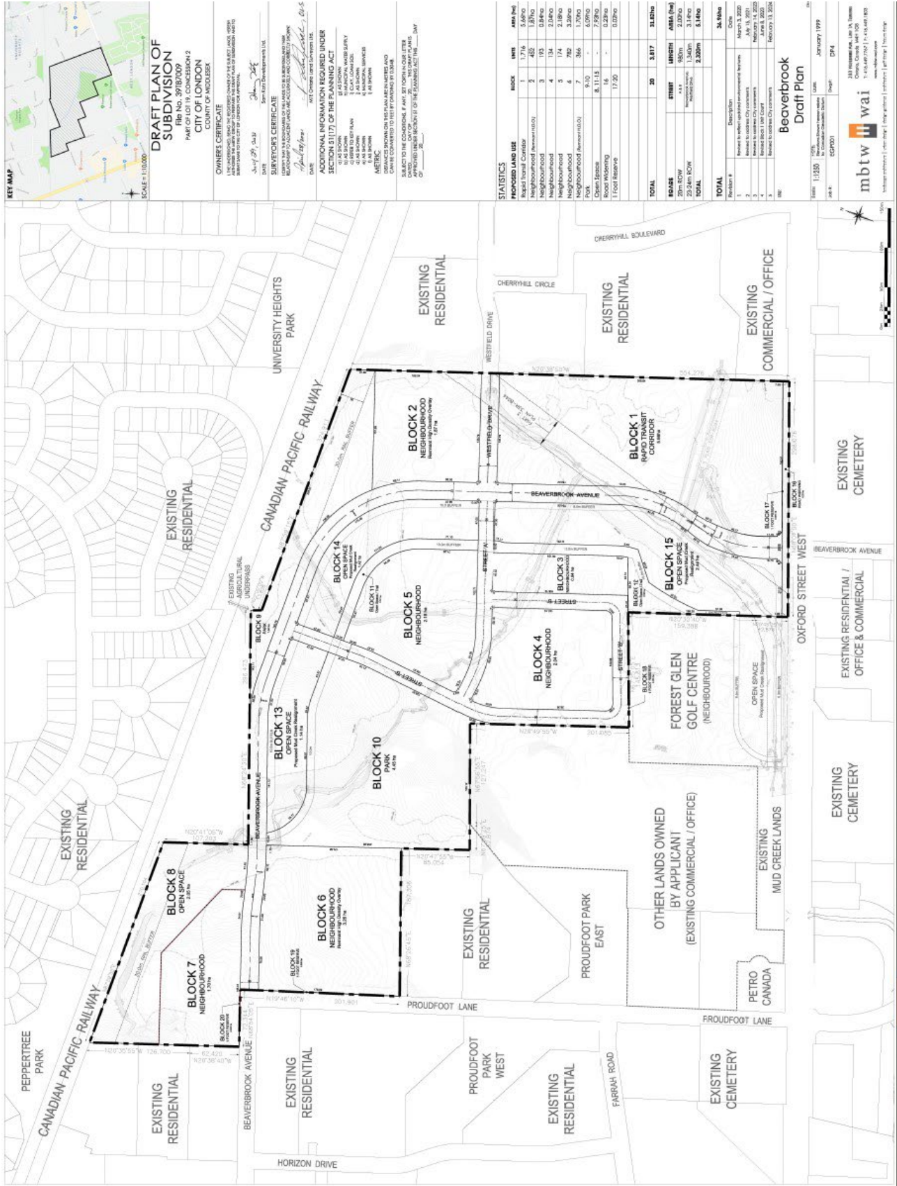
The above image represents the applicant's proposal as submitted and may change.