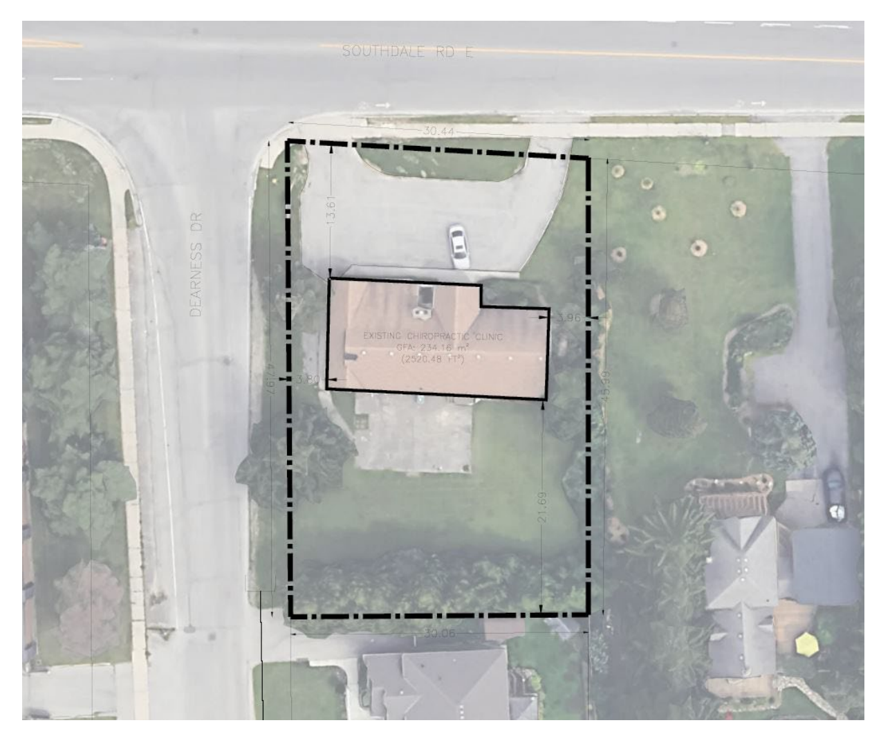
Existing Conditions Site Plan

The above image represents the applicant's proposal as submitted and may change.