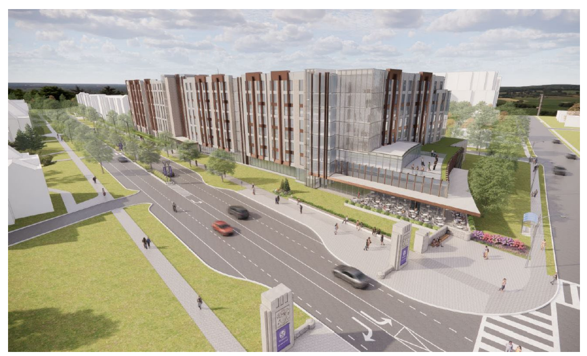
Figure 2: Rendering of proposed eight-storey student residence.

The above images represent the applicant's proposal as submitted and may change.