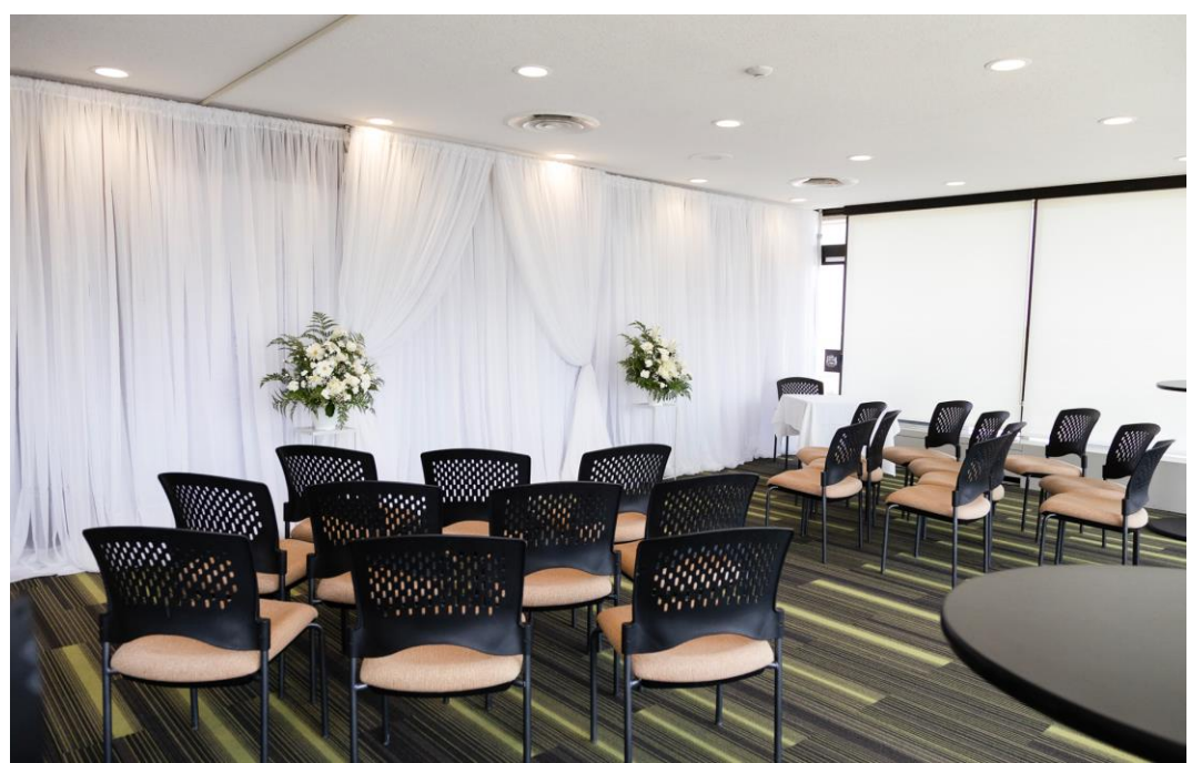
Typical room configuration for Civil Ceremonies. For larger groups (30-50 people) the room orientation may differ*