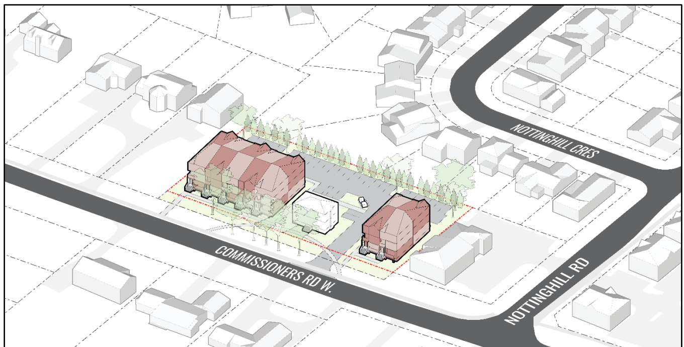
Isometric View of proposed built form (634 Commissioners Road West)

The above images represent the applicant's proposal as submitted and may change.