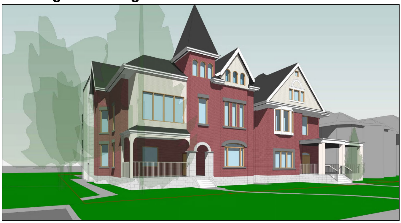
Conceptual Rendering – 300 Princess Avenue (view from Princess Avenue)