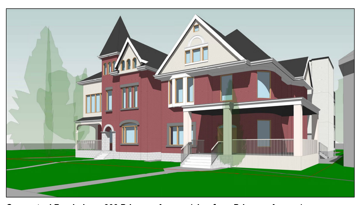
Conceptual Rendering – 306 Princess Avenue (view from Princess Avenue)

The above images represent the applicant's proposal as submitted and may change.