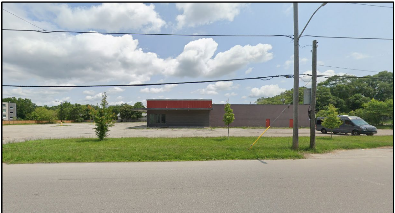
Figure 2 - Streetview of 150 King Edward Avenue (view looking east from King Edward Avenue)