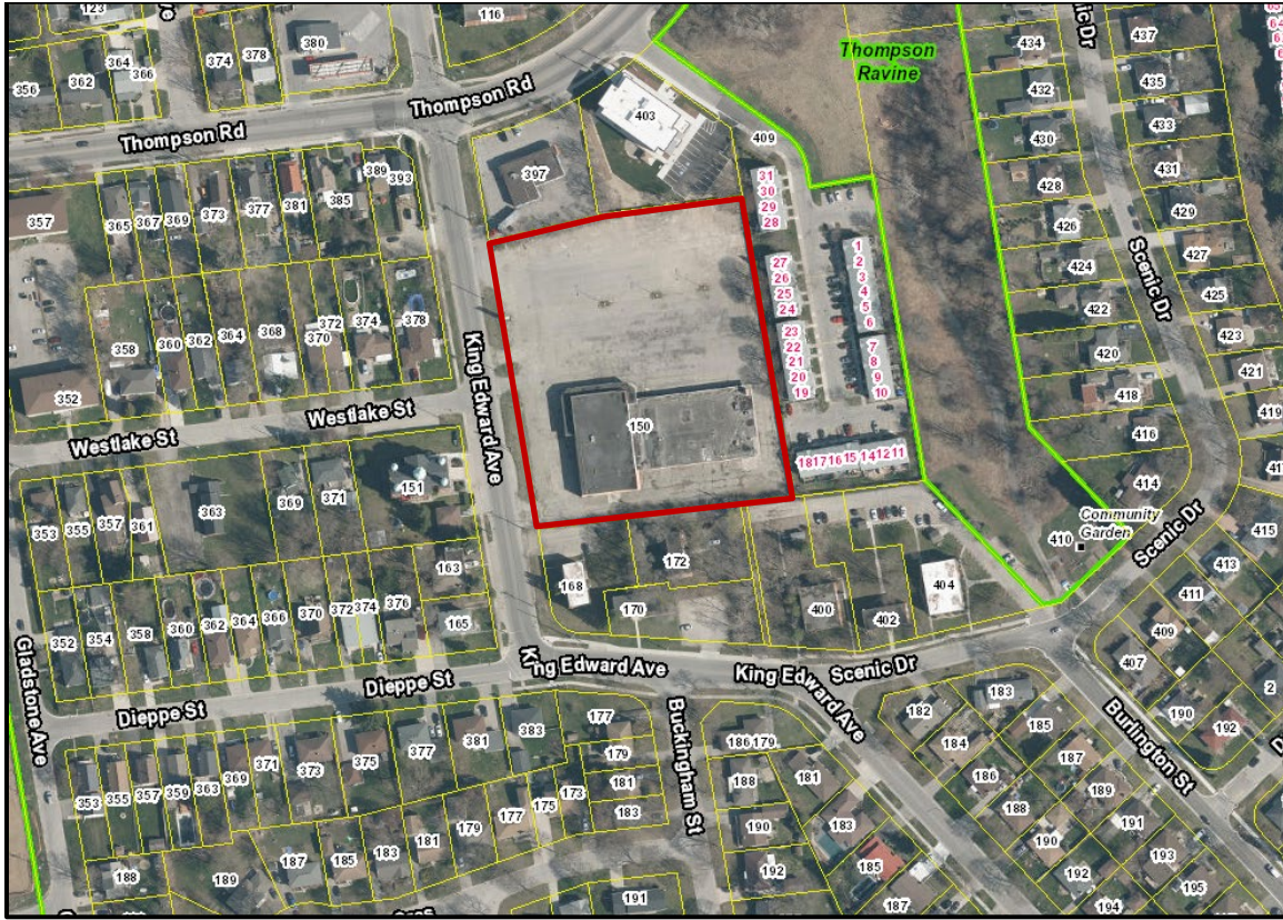
Figure 1- Aerial Photo of 150 King Edward Avenue and surrounding lands