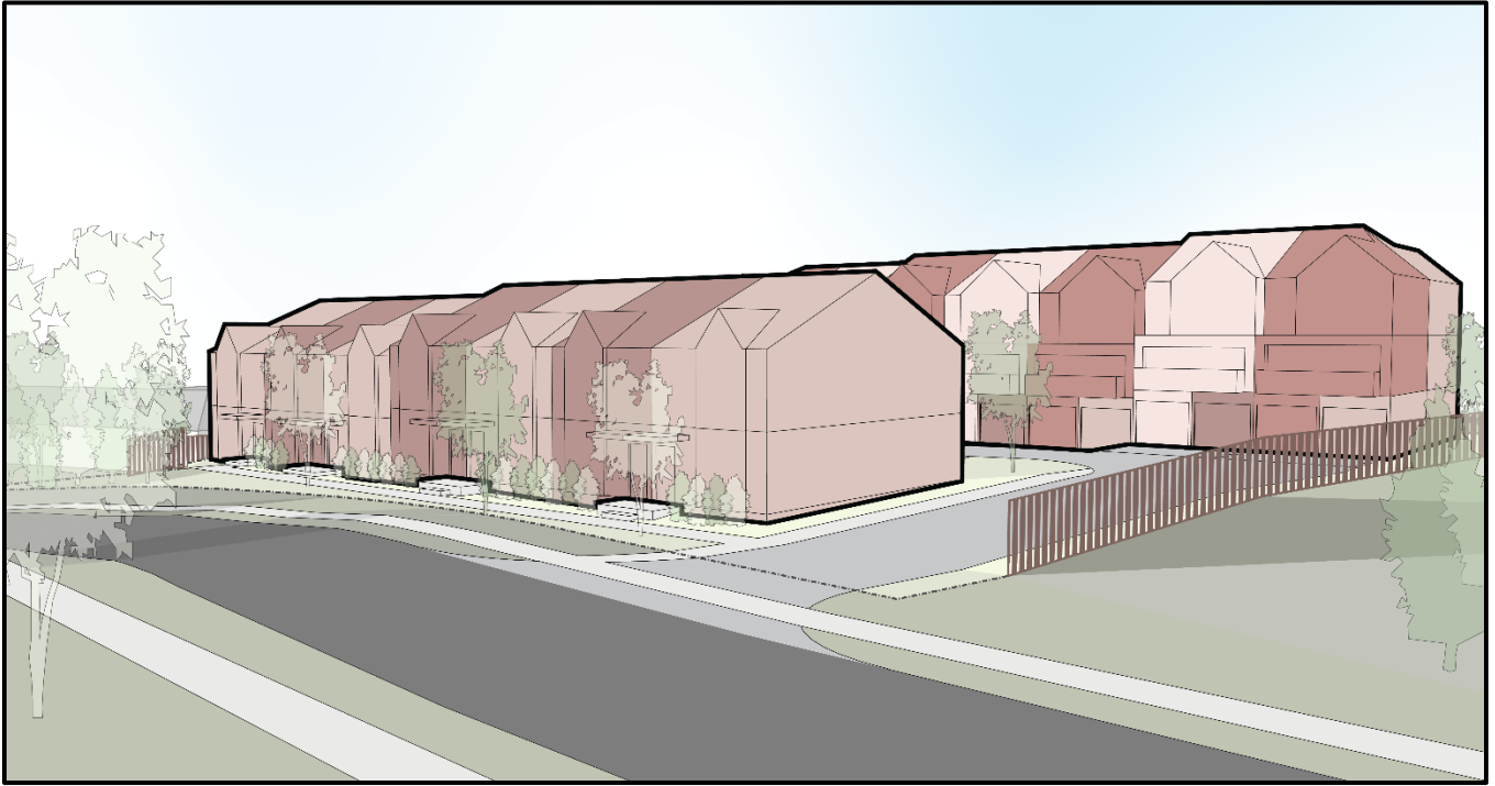
Figure 4. Rendering of Proposed Development.