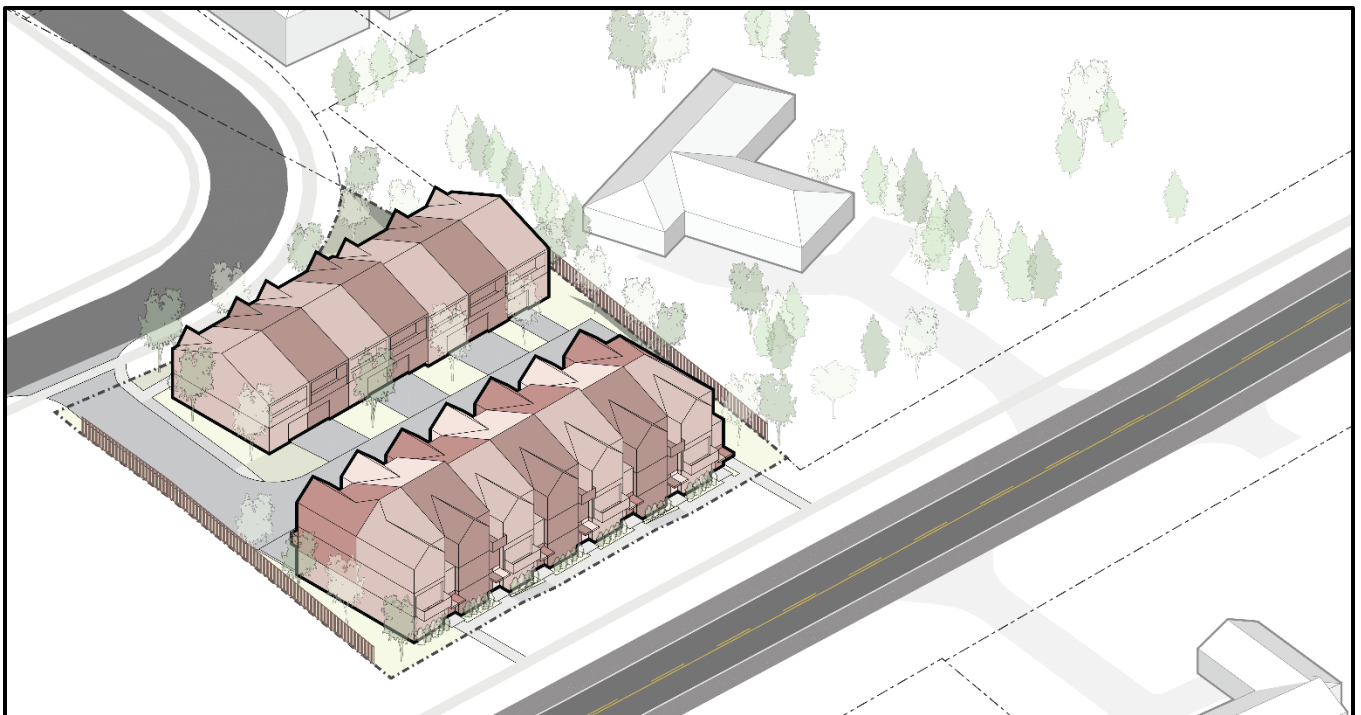
Figure 2. ISO View of Proposed Development.