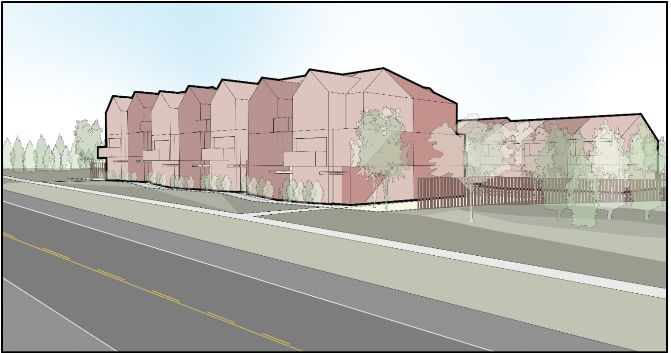
Figure 3. Rendering of Proposed Development.