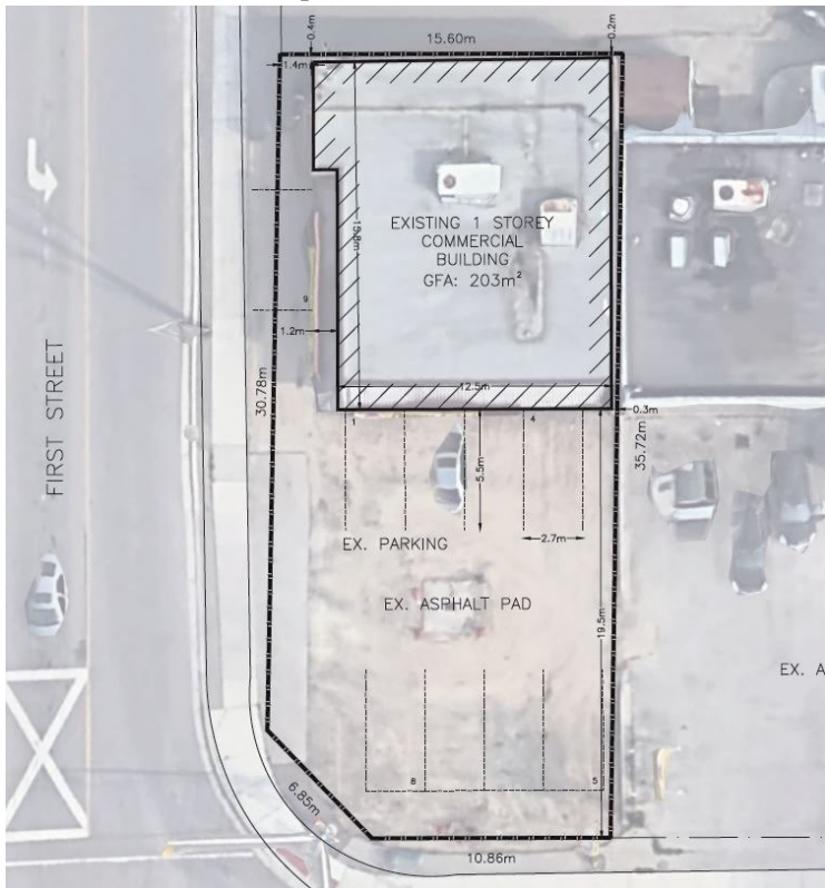
Figure 1: Site Layout

The above image represents the applicant's proposal as submitted and may change.