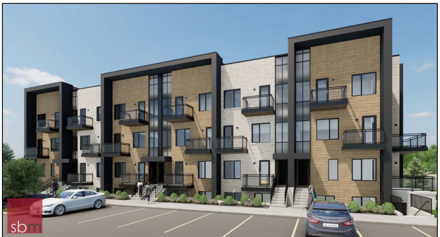
Figure 2. Rendering of Proposed Stacked Townhouse Development.