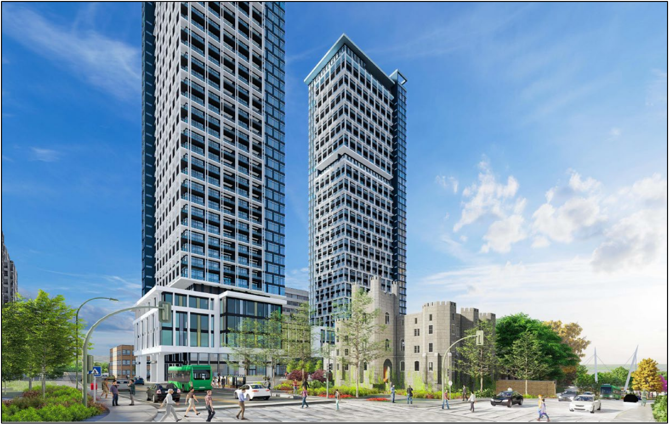
View from Dundas Street & Ridout Street North