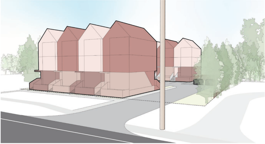
Massing model, looking northwest.