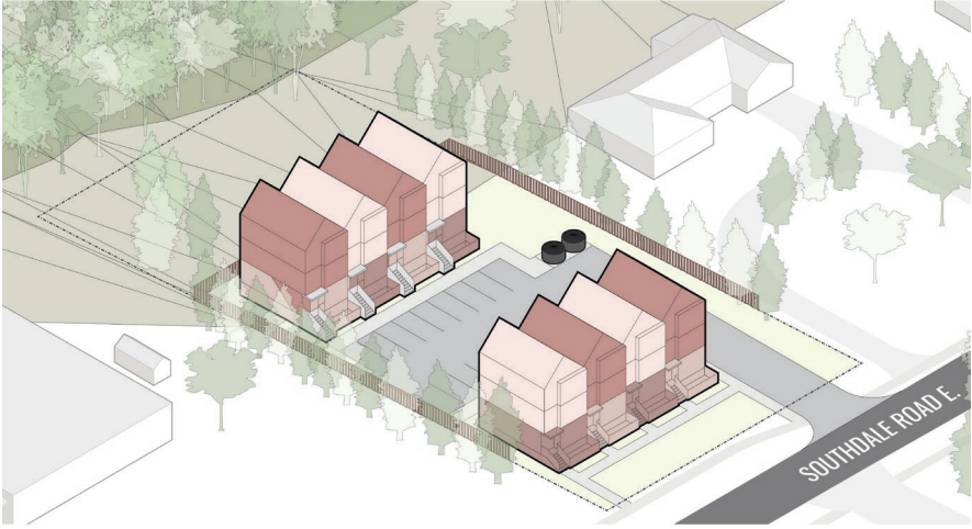
Massing model, top view looking northeast.