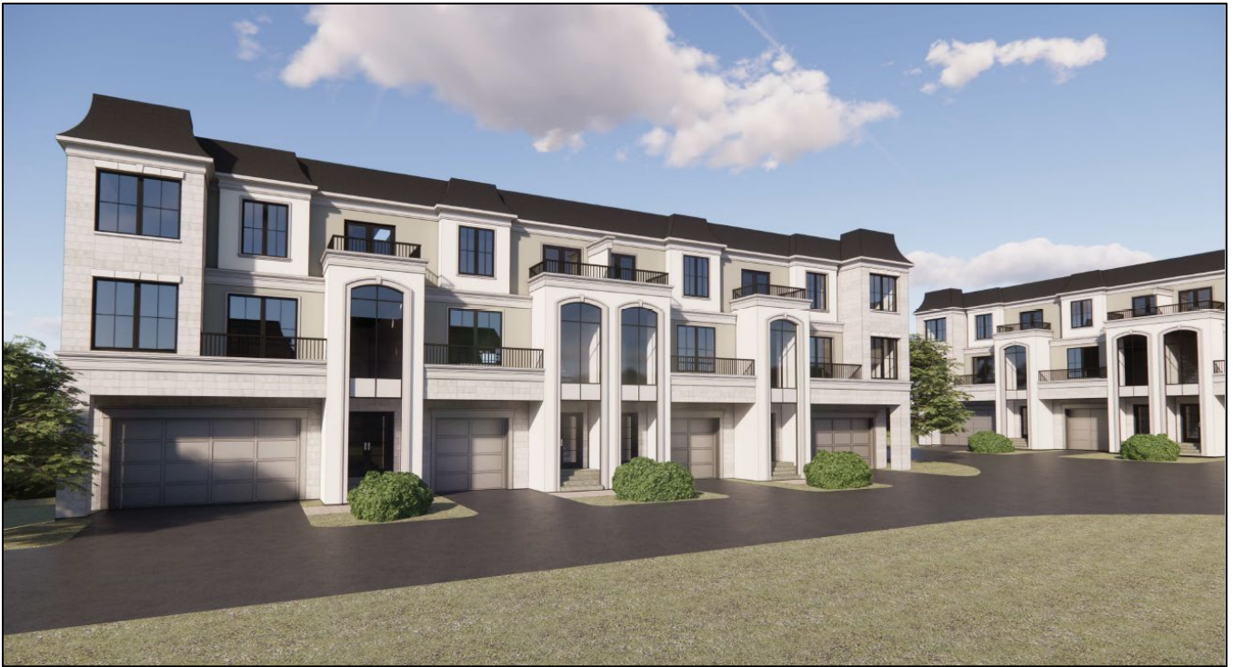
Conceptual Rendering – Internal Site View