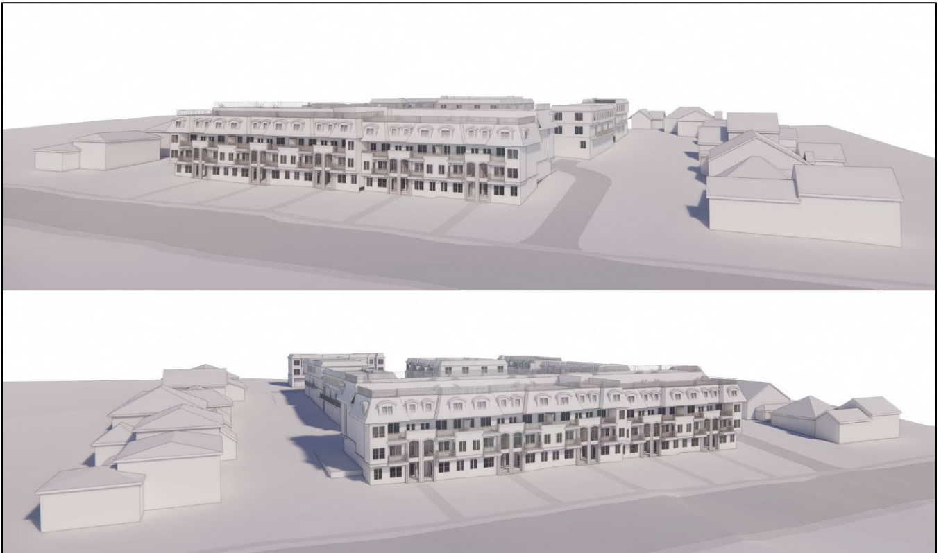
Conceptual Massing Model – Sarnia Road View

The above images represent the applicant's proposal as submitted and may change.