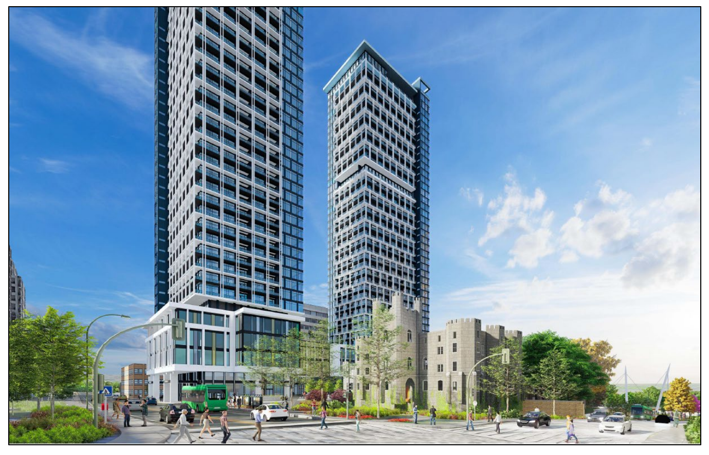
View from Dundas Street & Ridout Street North