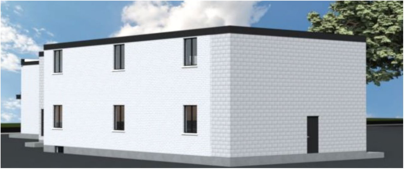
Rendering looking north at the proposed building

The above images represent the applicant's proposal as submitted and may change.