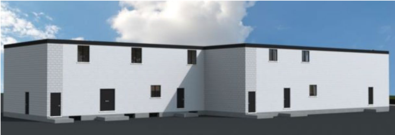
Rendering looking west at the proposed building