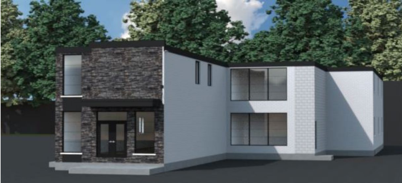
Rendering looking south along Horton Road East