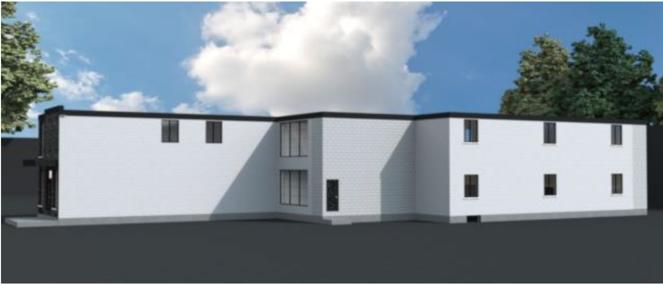
Rendering looking east at the proposed building