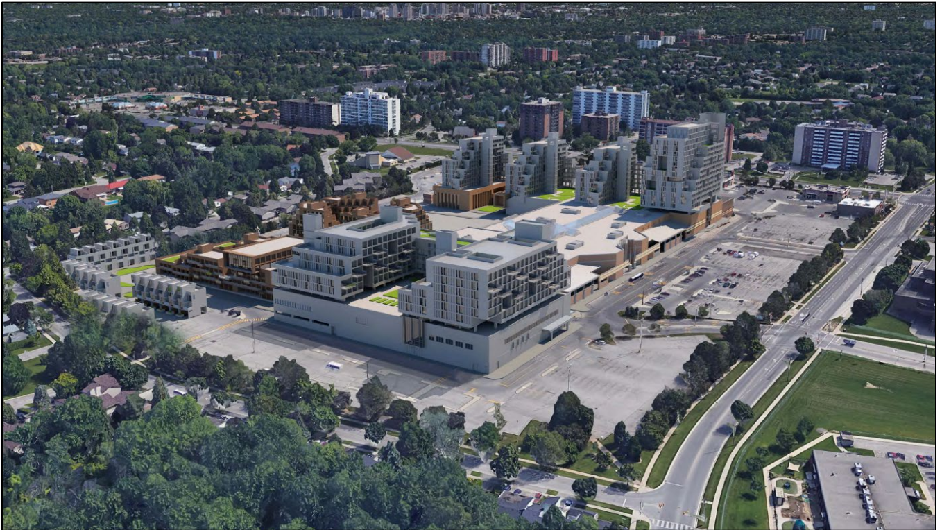
Northeast View – Viscount Road