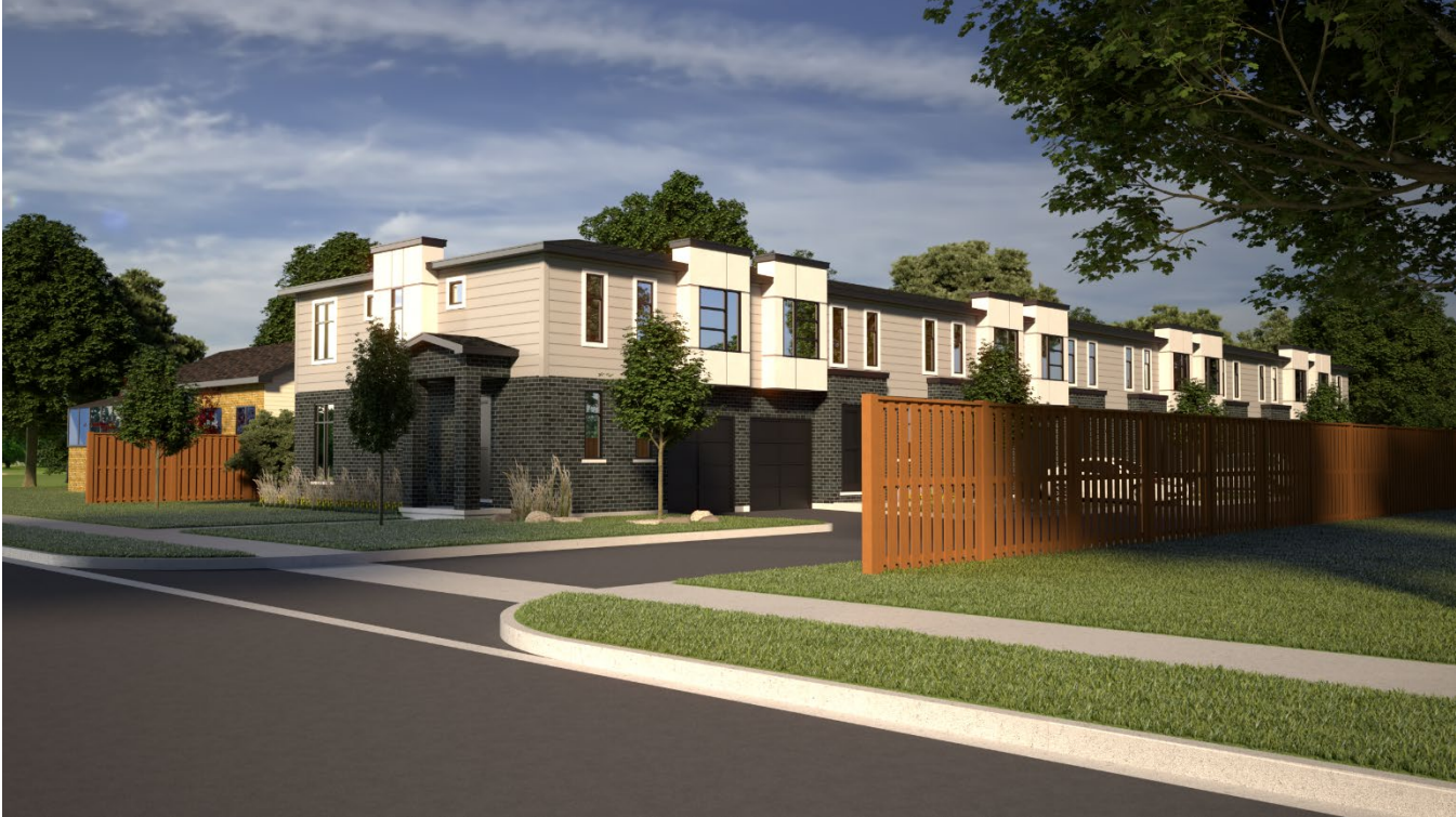
Front View of Proposal from Wethered Street