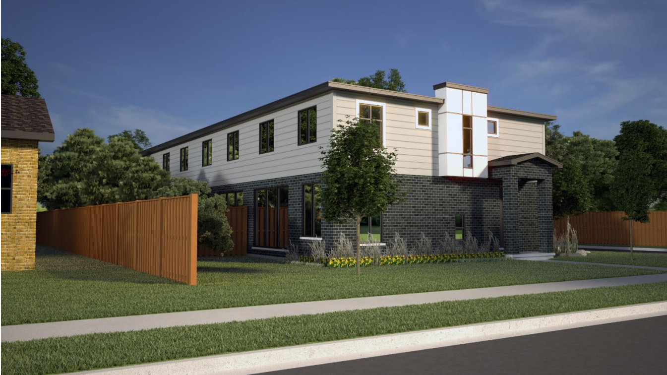
Rear View of Proposal from Wethered Street