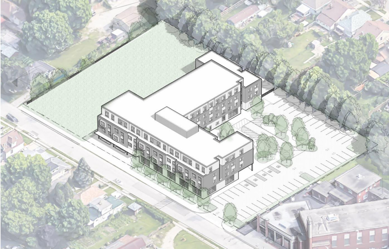
Orthographic view of the building from the southwest

The above images shows the applicant's proposal as submitted and may change.