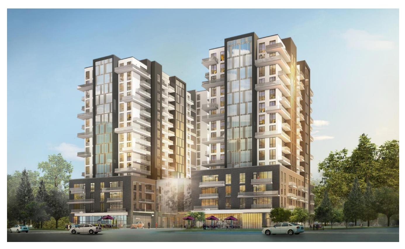
Proposed Highbury Avenue Front Elevation

The above image represents the applicant's proposal as submitted and may change.