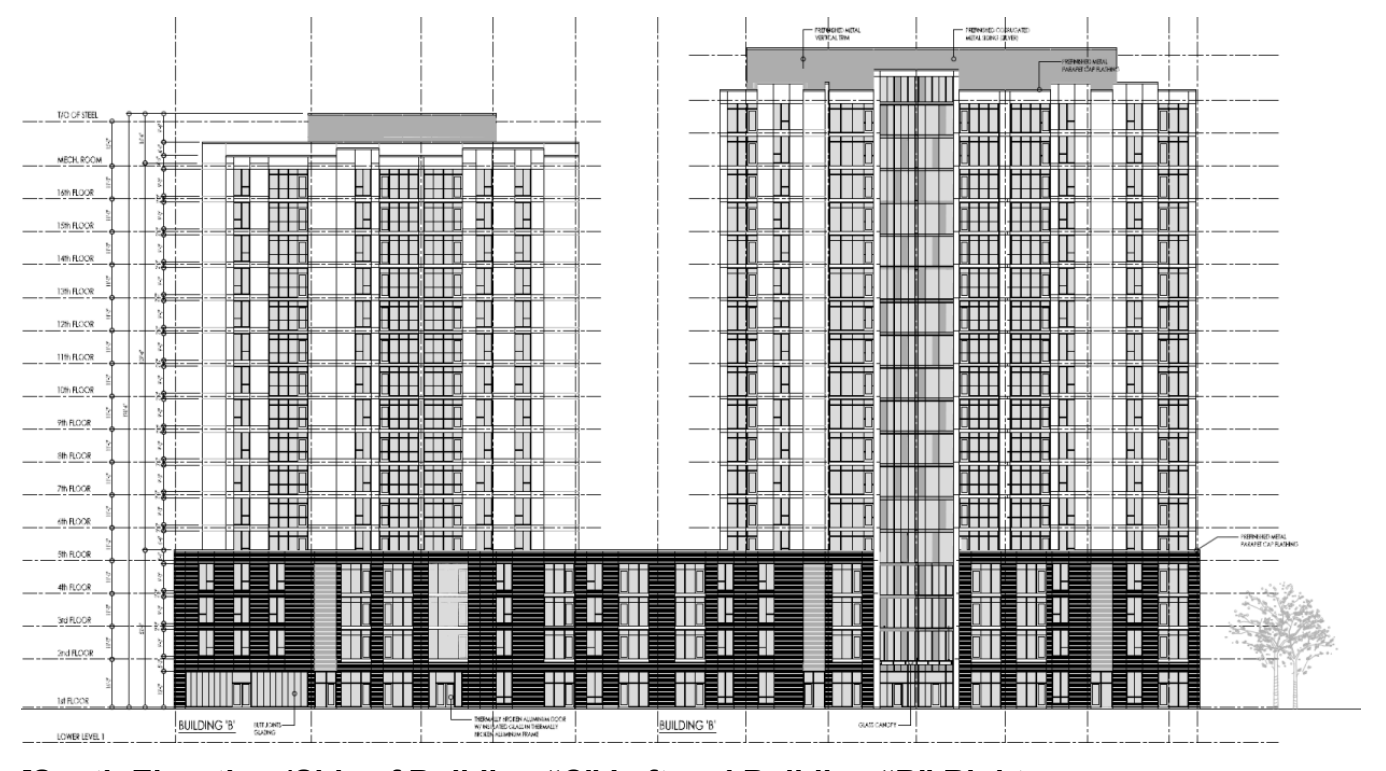
[South Elevation (Side of Building "C" Left and Building "B" Right

The above images represent the applicant's proposal as submitted and may change.