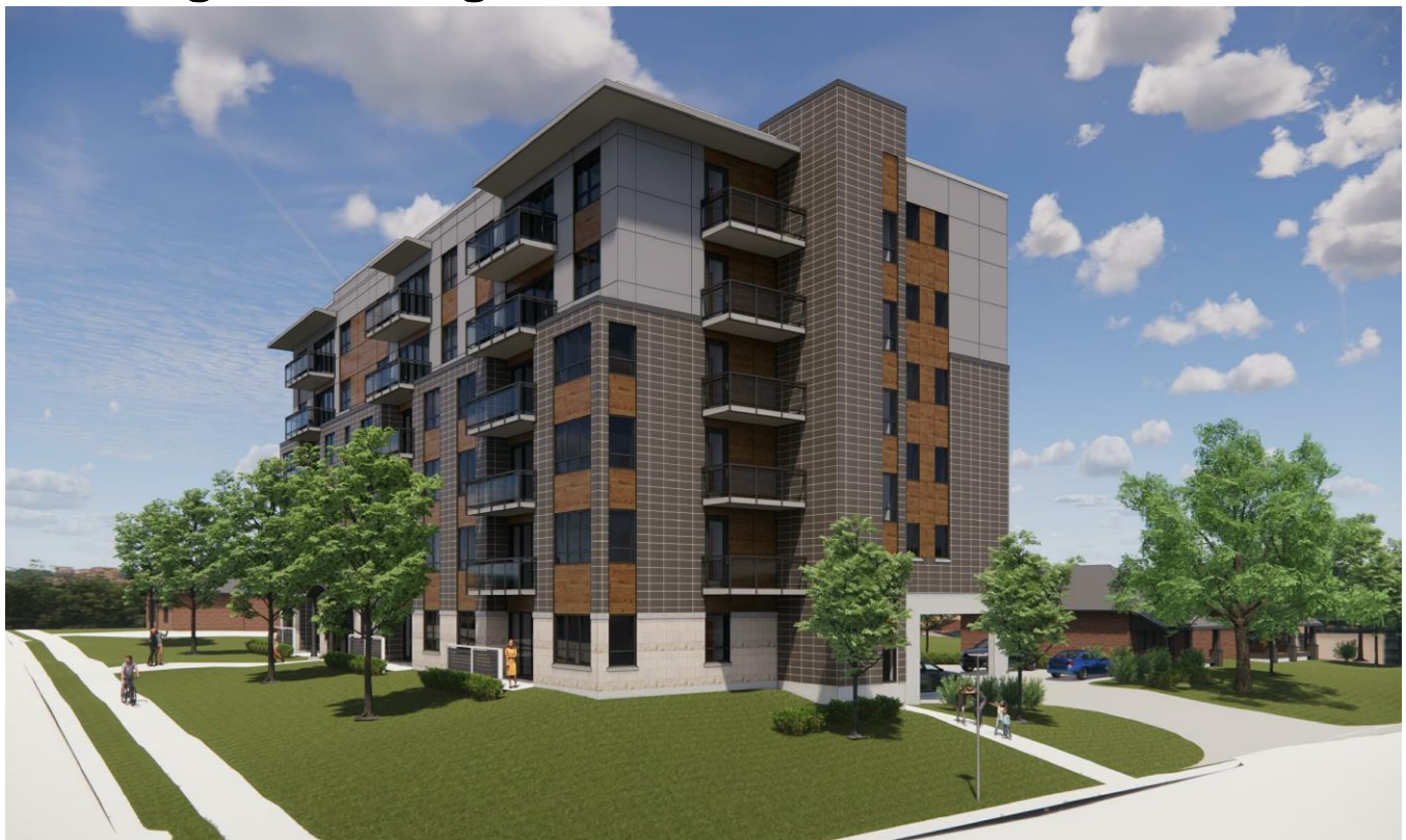
Conceptual Rendering –Springbank Drive perspective