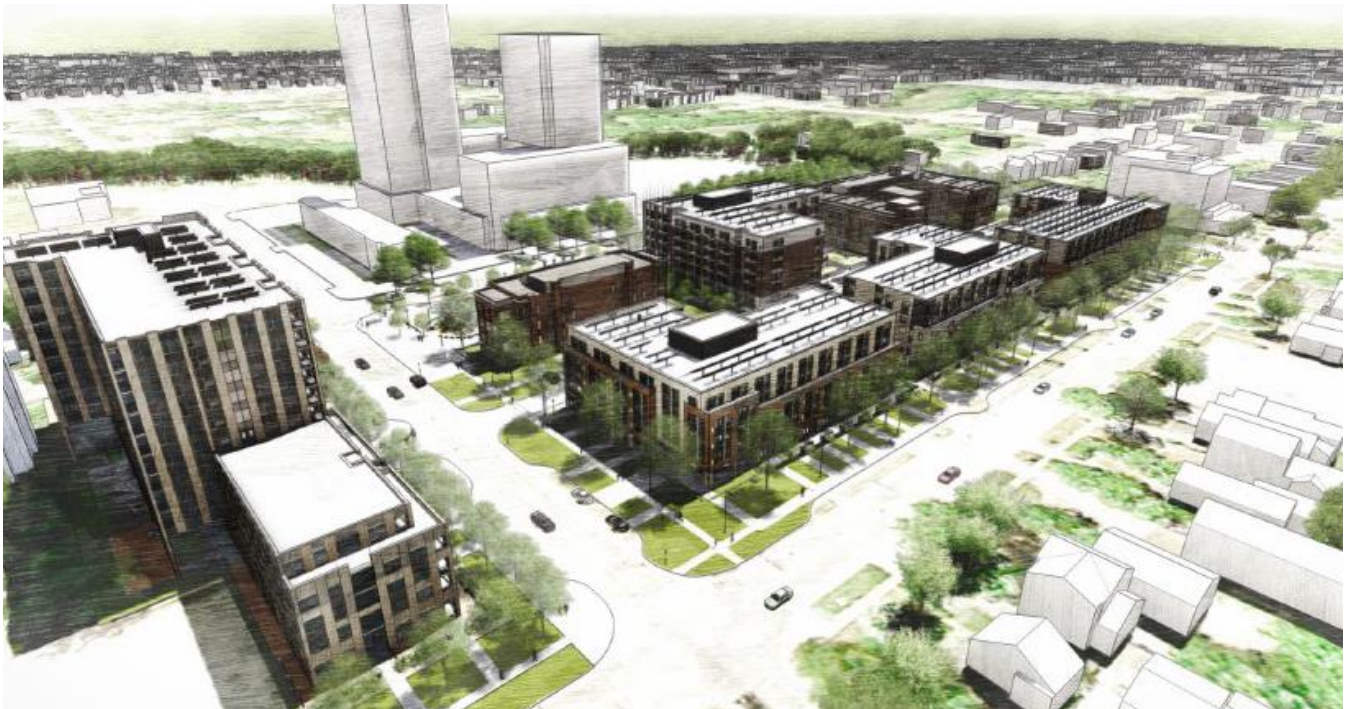
Rendering (Looking Northeast)