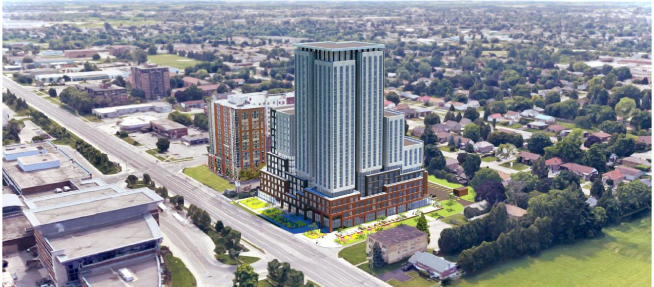
Revised Building Rendering (aerial view)

The above images represent the applicant's proposal as submitted and may change.