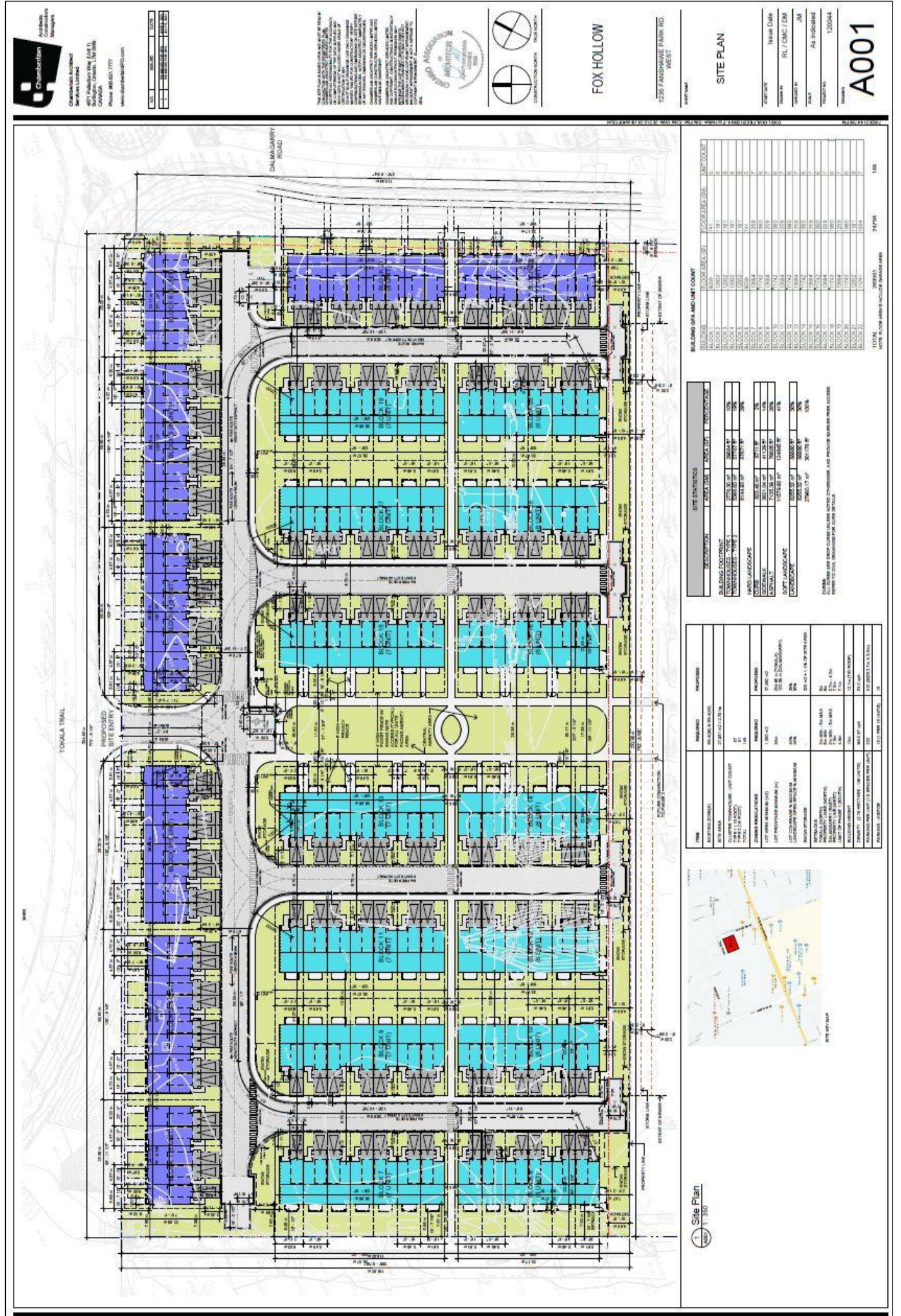
The above image represents the applicant's proposal as submitted and may change.