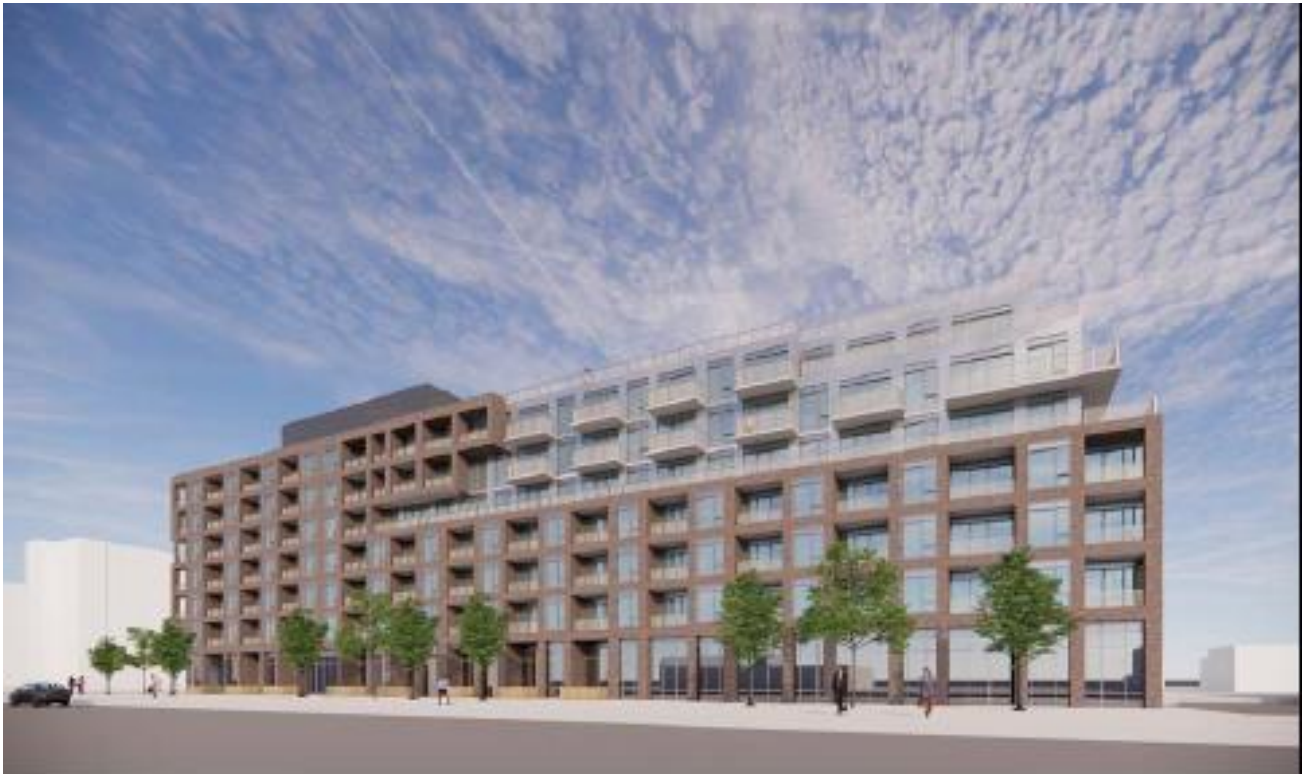
Conceptual Renderings (Front View)

The above images represent the applicant's proposal as submitted and may change.