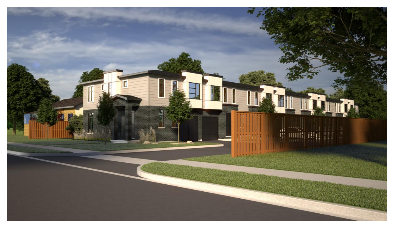
Original rendering – front view from Wethered Street looking northeast