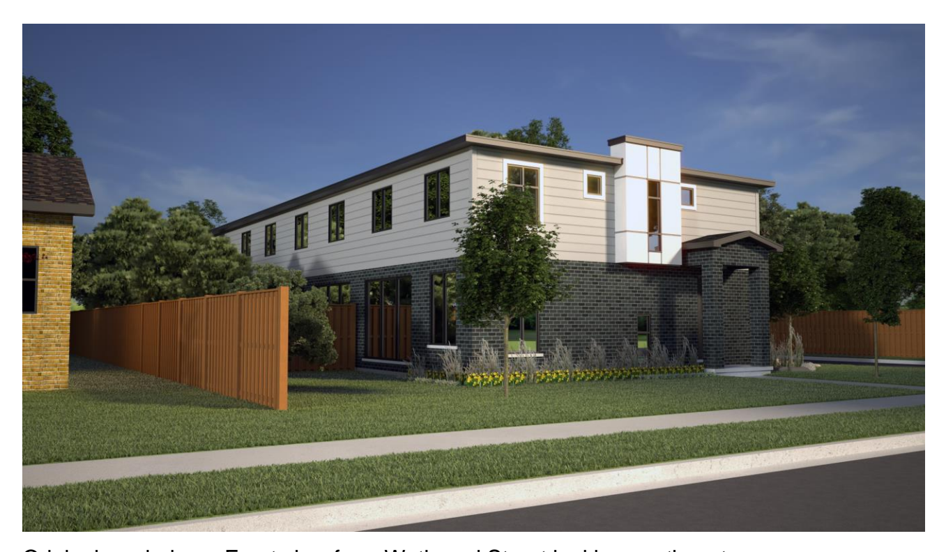
Original rendering – Front view from Wethered Street looking southeast

The above images represent the applicant's proposal as originally submitted and do not reflect recent design changes.