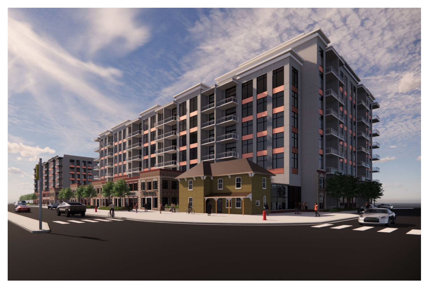
View from Intersection of Hyde Park Road and North Routledge Park

The above image represents the applicant's proposal as submitted and may change.