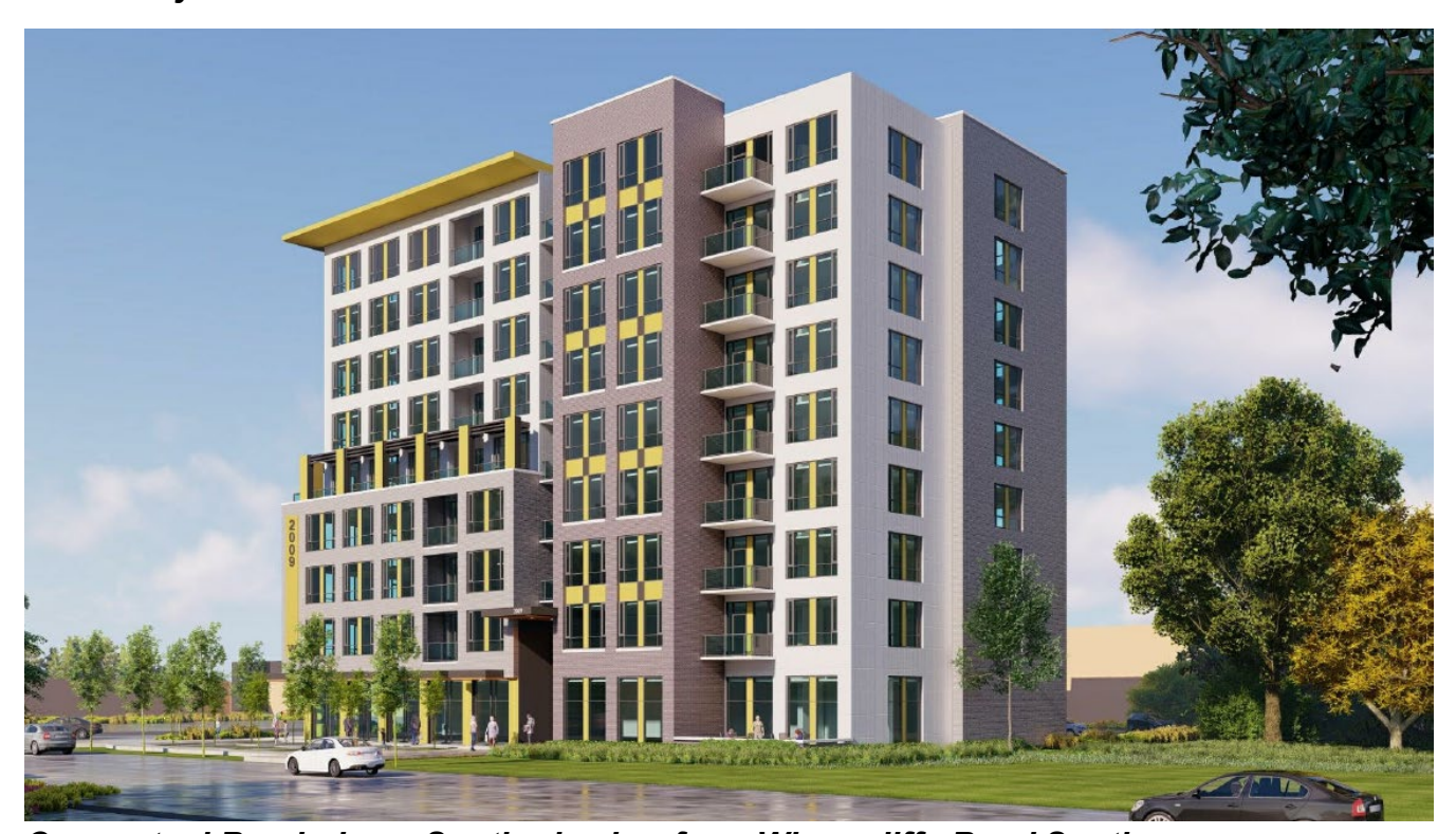
Conceptual Rendering – Southerly view from Wharncliffe Road South

The above images represent the applicant's proposal as submitted and may change.