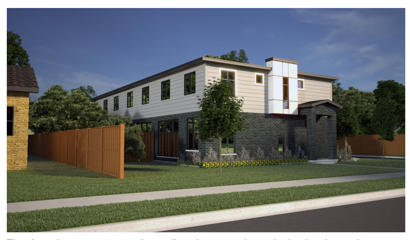
The above images represent the applicant's proposal as submitted and may change.