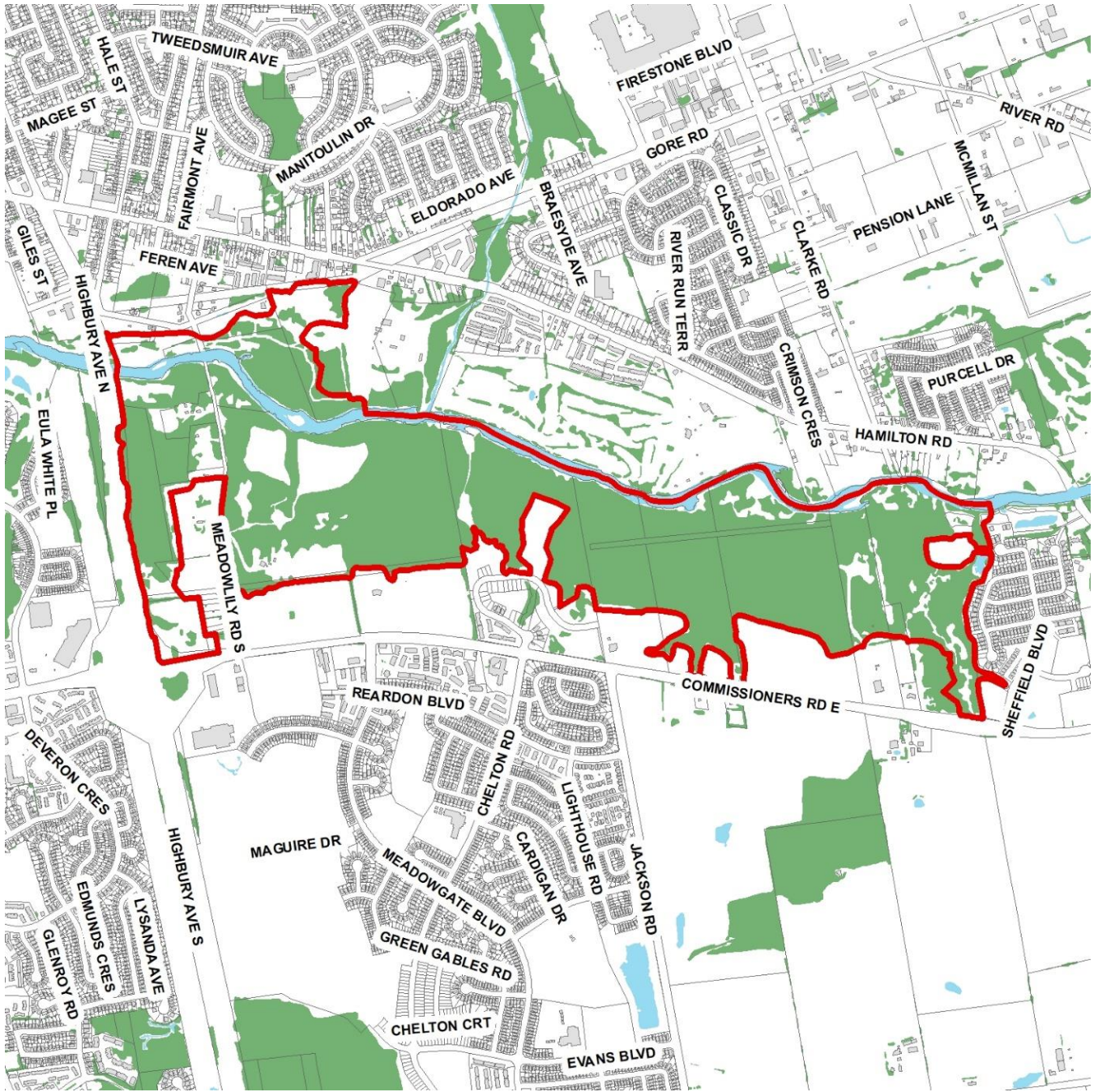
New ESA boundary