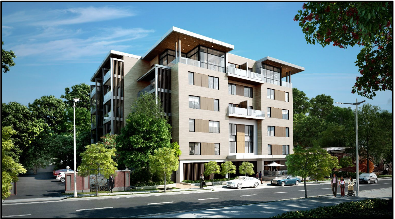
Perspective looking Southwest from College Avenue