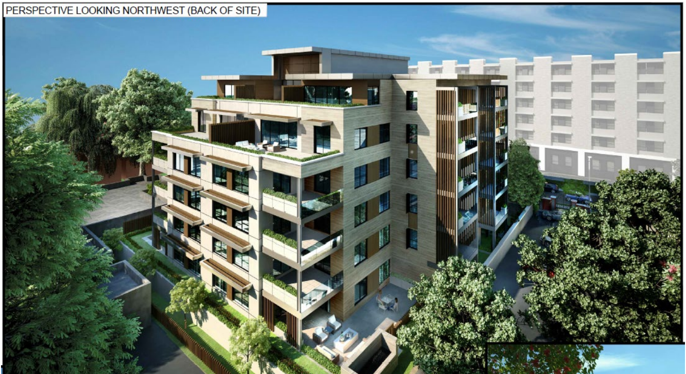
Perspective looking Northwest (Back of Site)

The above images represent the applicant's proposal as submitted and may change.