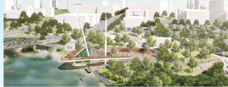
Exhibit 2. Suspended Walkway with Softscape Terraces

The evaluation selected the suspended walkway and the softer landscaped terraces as the preferred options. The selected options maintain the spirit and vision of the award-winning "Ribbon of the Thames" design while incorporating public input and more comprehensive knowledge of the ecology at the Forks. Exhibit 2 illustrates the chosen alternative for the Forks of the Thames.