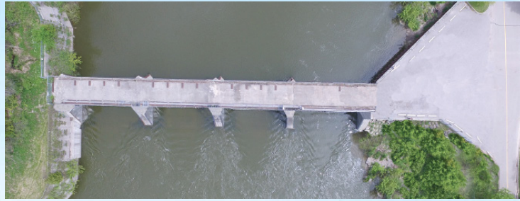
Exhibit 1. Springbank Dam Partial Dam Removal