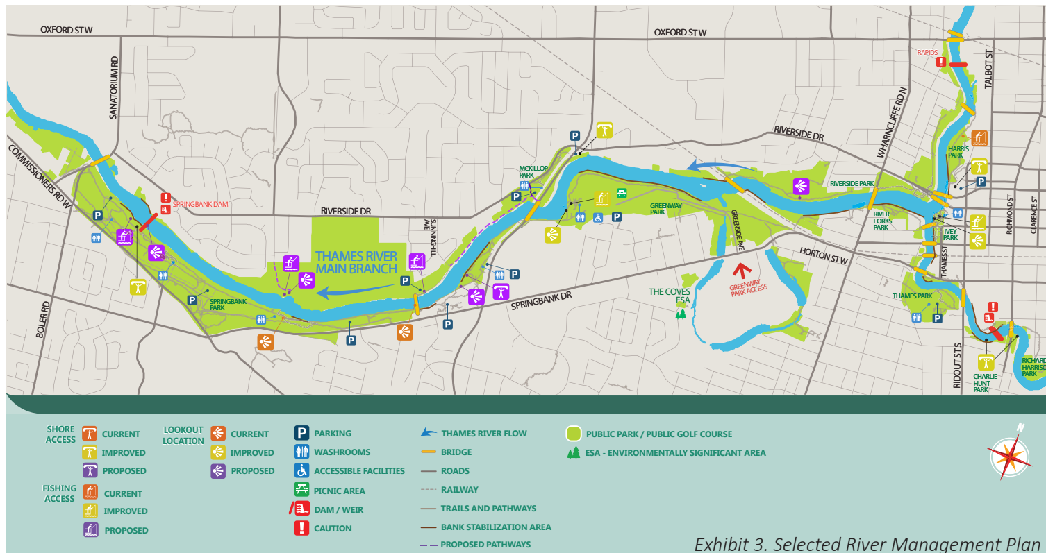
Exhibit 3. Selected River Management Plan